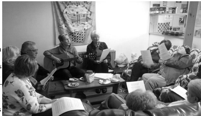
Singing circle at the YARD on Tuesday 9th April

Lunch group members also take part in other local groups. Why not head out the station road and look in and say hello. Your name is in the pot! We have newspapers, a laptop with an internet connection for public use as well as some of the best conversation to be heard anywhere! Hope to see you there very soon!